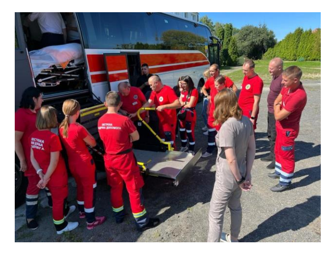
4 - Ukrainian medical professionals are learning to use a lift to up- and off-load patients on stretchers