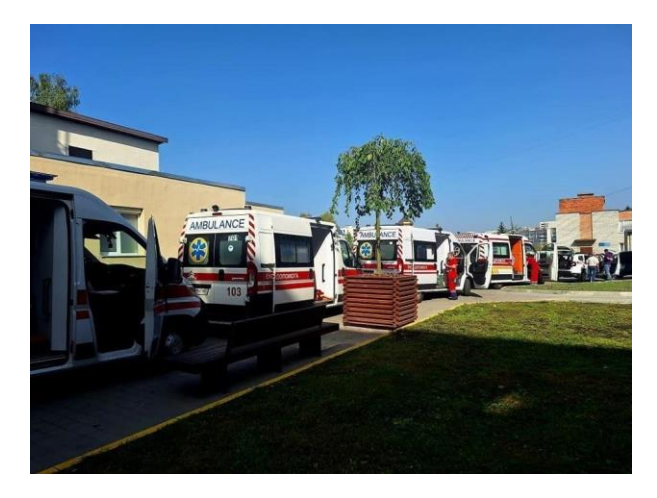
1 - Evacuation of 17 patients and 7 family members to Medical HUB Jasionka for future transportation by Norwegian team to Germany, France, Netherlands, and Norway. (Volodymyr Ananievych, Lviv EMS, Sept. 2023)