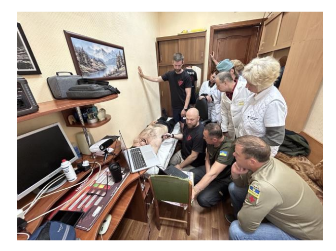
2 - Kharkiv Oblast frontline hospital physicians receive point of care ultrasound training from Global Response Medicine.

A cohort of 8 clinicians was selected for an emergency medicine fellowship in conjunction with the Kharkiv Medical University and Kharkiv Regional Hospital. The cohort has received two rounds of training to date with a third in process currently (October) for the development of civilian emergency medicine in the region.